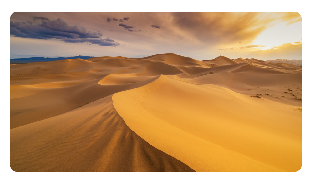
On Earth, the climate and weather changes depending on location. Some places are very cold, some are very hot and some are wet or dry.