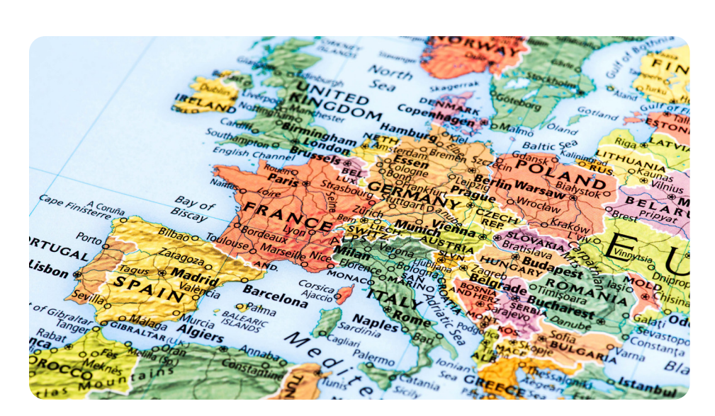
The land on Earth is surrounded by seas and oceans. Maps show a 2-D image of land, seas and oceans.