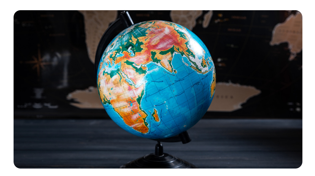
We live on a planet called Earth. A 3-D model of Earth is called a globe.

Read these interesting facts about the world with a parent, carer or teacher.