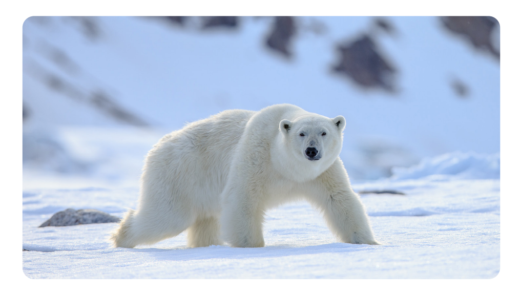
A habitat is the place where an animal or plant lives. Every habitat has a different group of animals or plants that live there.