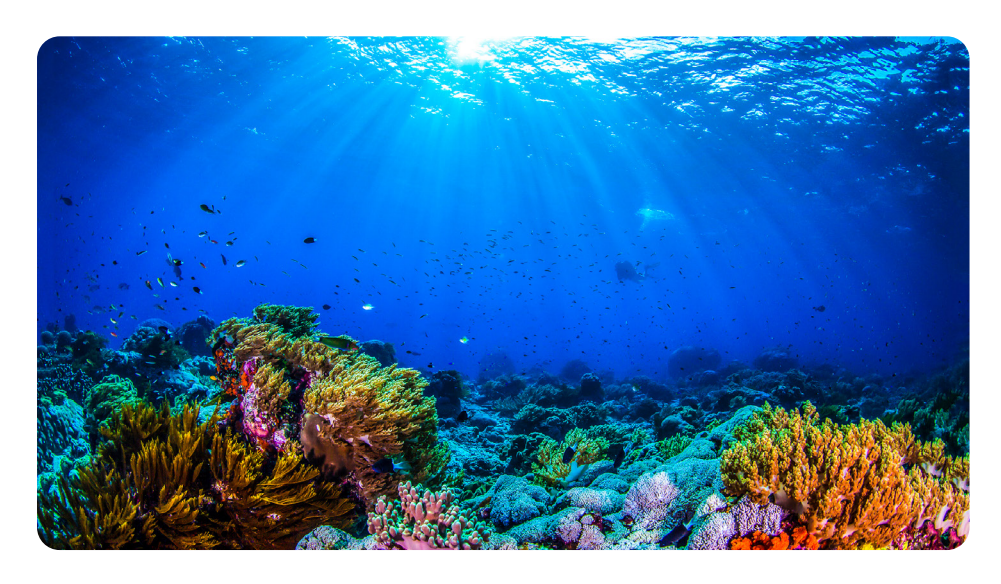
Habitats include oceans, mountains, forests, savannahs, woodlands, rivers and deserts.