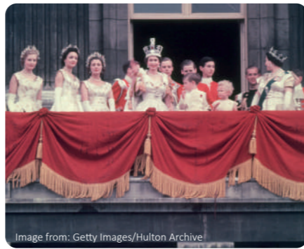
Queen Elizabeth II on her coronation.

A coronation is a ceremony where the crown is placed on the head of the new king or queen. Elizabeth II was the Queen of the United Kingdom for 70 years until she died in 2022. The coronation ceremony of Elizabeth II took place on 2nd June 1953 at Westminster Abbey, London. Many people celebrated the coronation by holding street parties.