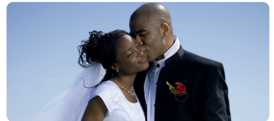
Weddings happen when two adults get married.