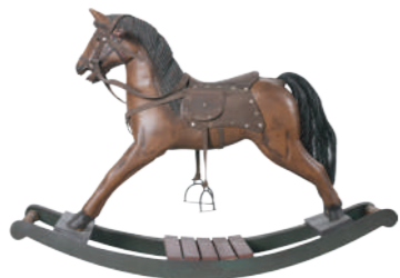
wooden rocking horse