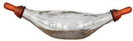
Victorian baby bottle

An artefact is an object from the past. Museums often display historical artefacts. Artefacts can tell us about how people used to live. Everyday objects like baby bottles, clothing, toys and books can tell us about childhood in the past.