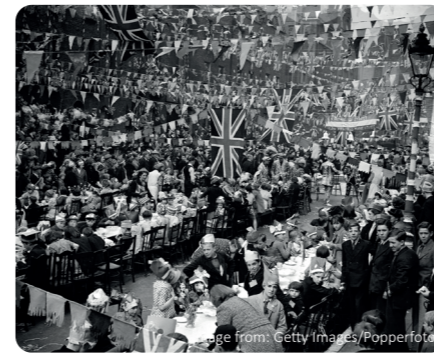
Street party to celebrate the coronation.