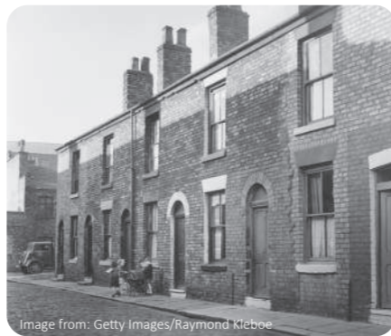
A street in the 1950s.

The way people use land changes over time. For example, in the 1950s there were fewer cars, so fewer roads were needed. Today lots of people have cars, so there are many more roads for people to drive on and driveways for parking.