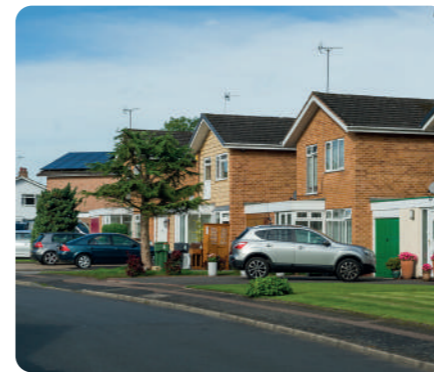
A street today.