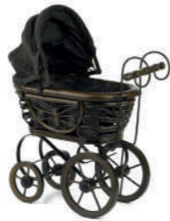
wood and metal pram